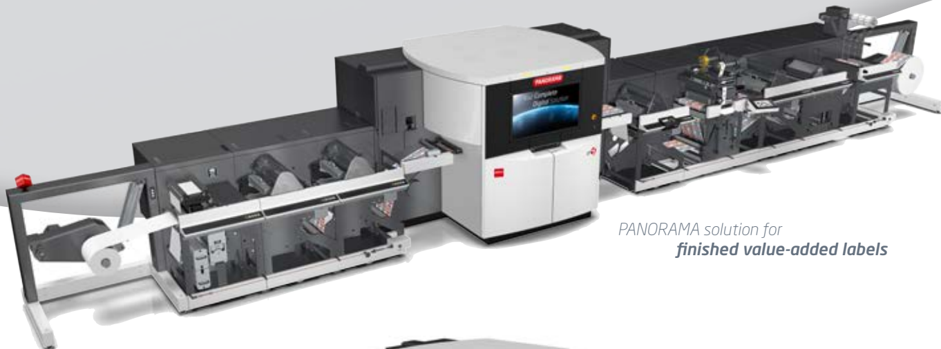
PANORAMA solution for finished value-added labels